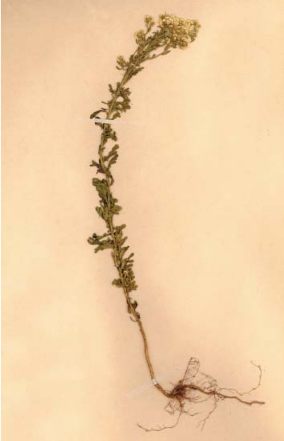
Fig. 2. – Conyza triloba Decne. Flora Bohemica: Distr. Blatná [recte Strakonice], ad piscinam prope vicum Černivsko. V. 1971, leg. M. Deyl (PR).