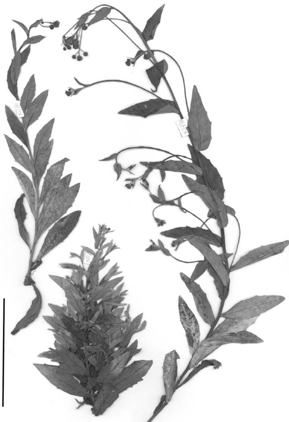
Fig. 11. – Triple hybrids from cross no. X21: ( Hieracium transsilvanicum × H. umbellatum – morphotype of low altitude) × H. umbellatum – high mountain morphotype, scale bar = 10 cm.