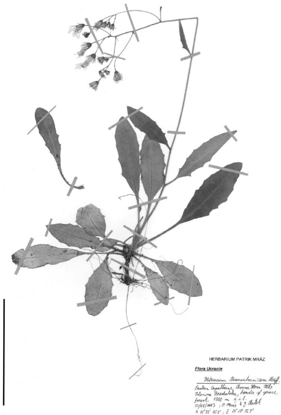
Fig. 3. – Habitus of parental taxon Hieracium transsilvanicum Heuff., scale bar = 10 cm.