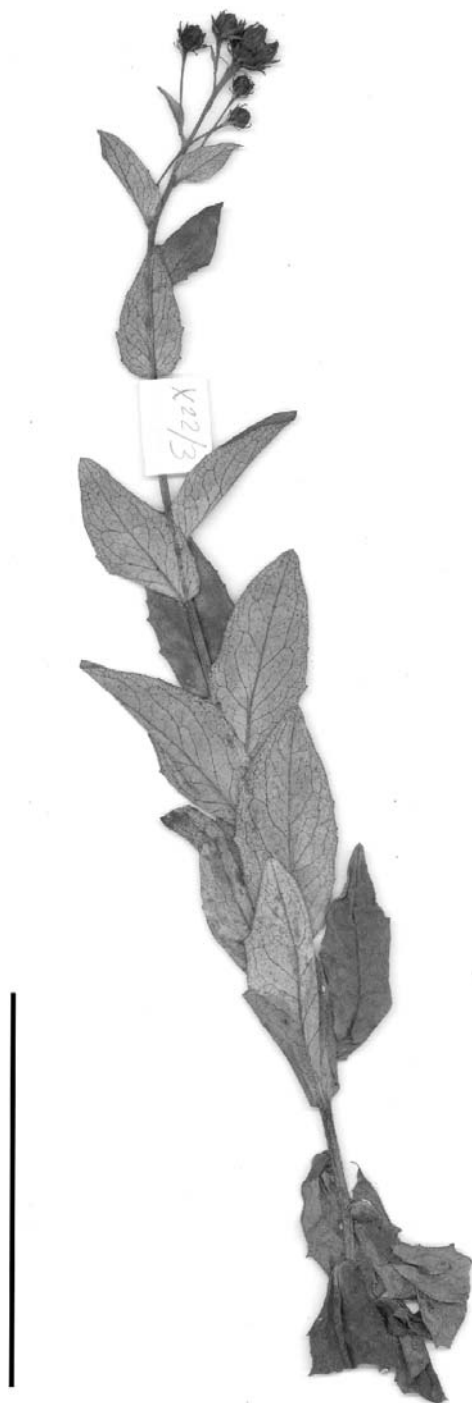
Fig. 4. – Habitus of parental taxon Hieracium umbellatum L. (high mountain morphotype). This plant (no. X22/3) arose from selfing in the cross no. X22 (see text), scale bar = 10 cm.