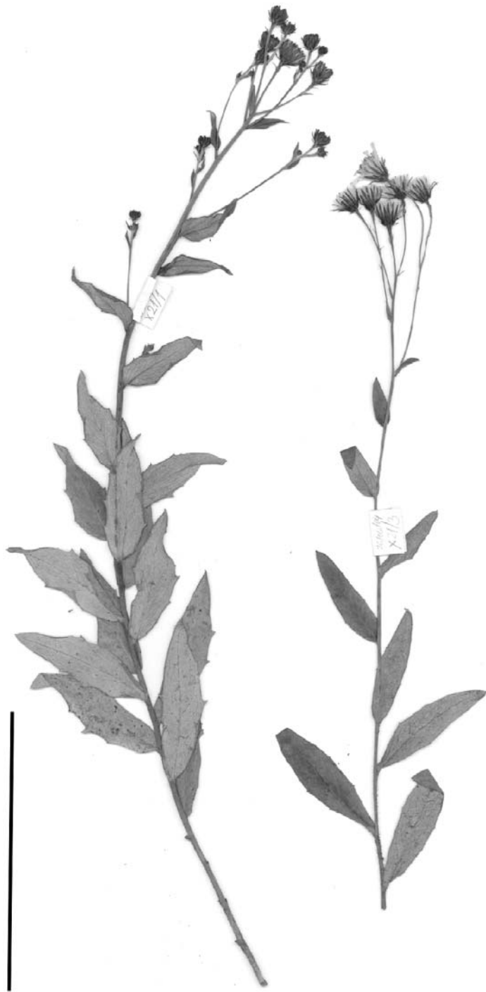
Fig. 12. – Triple hybrids from cross no. X22: H. umbellatum – high mountain morphotype \times ( Hieracium transsilvanicum \times H. umbellatum – morphotype of low altitude), scale bar = 10 cm.