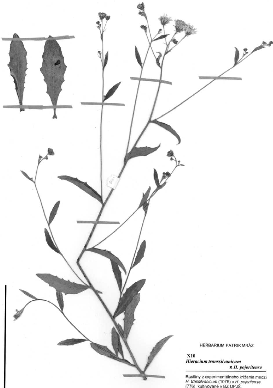
Fig. 10. – Hybrid progeny from cross no. X10: Hieracium transsilvanicum × H. pojoritense , scale bar = 10 cm.