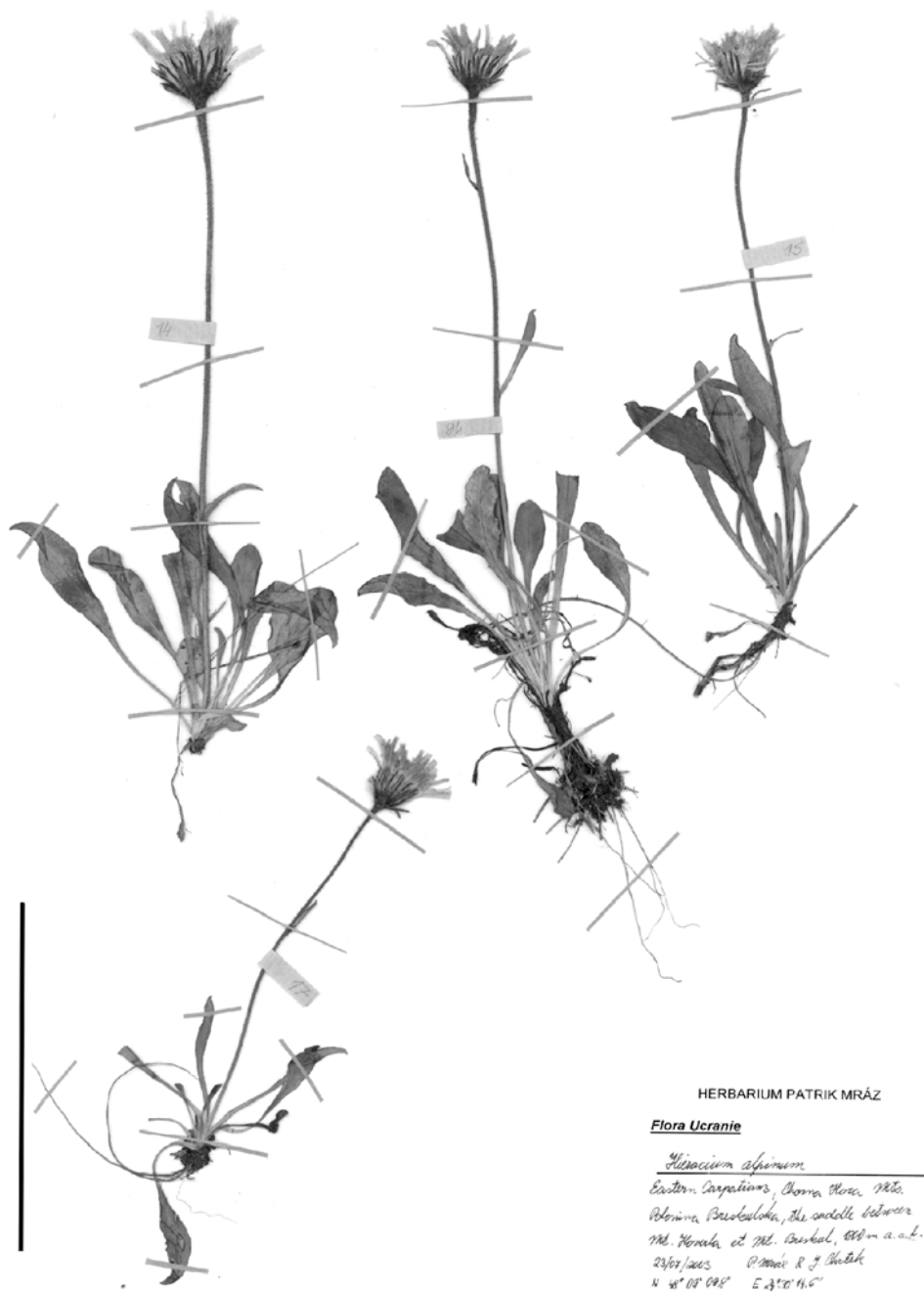
Fig. 1. – Habitus of parental taxon Hieracium alpinum L., scale bar = 10 cm. See Electronic Appendix 1 for colour images of Figs 1–12.