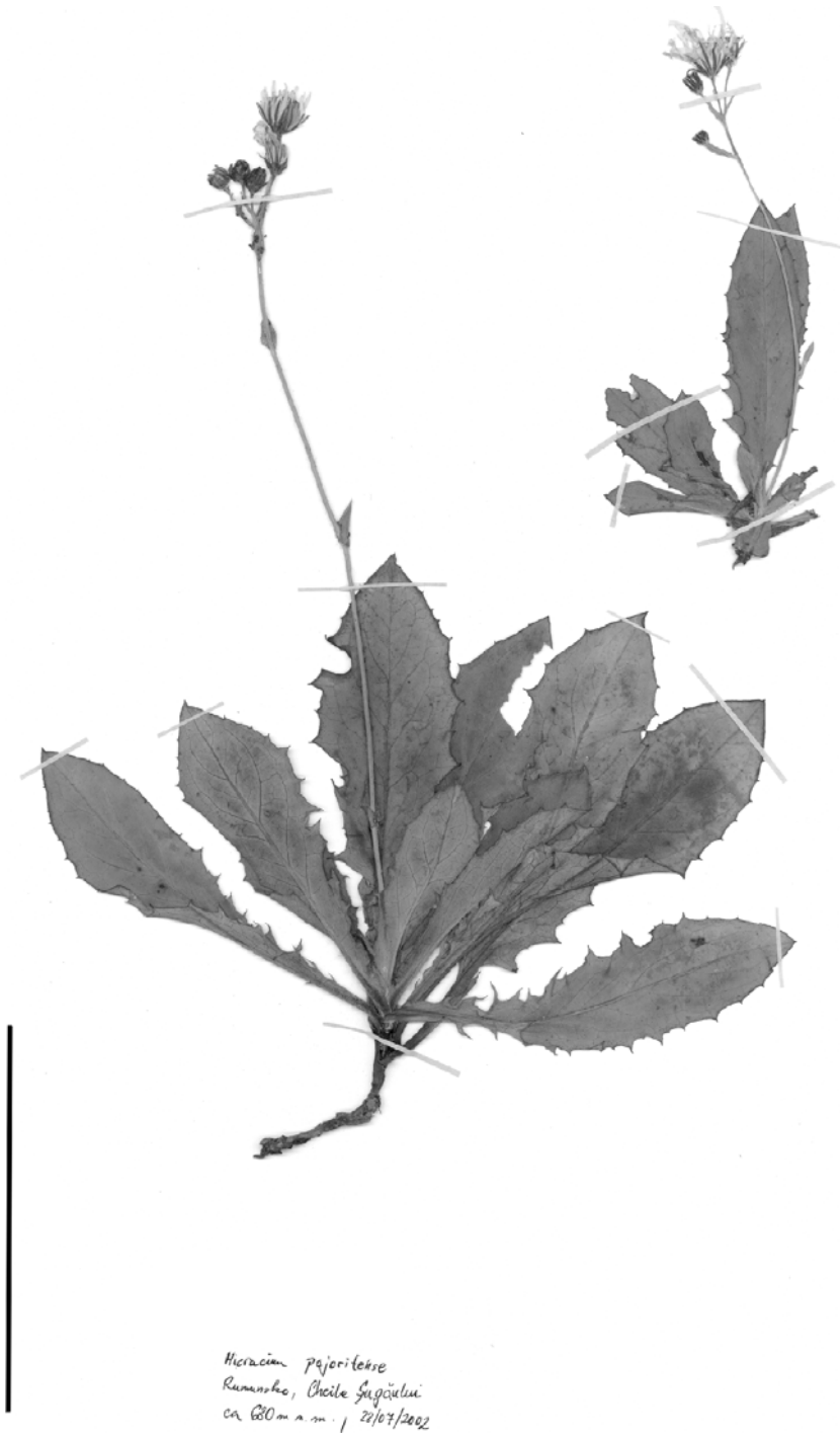
Fig. 2. – Habitus of parental taxon Hieracium pojoritense Wol., scale bar = 10 cm.