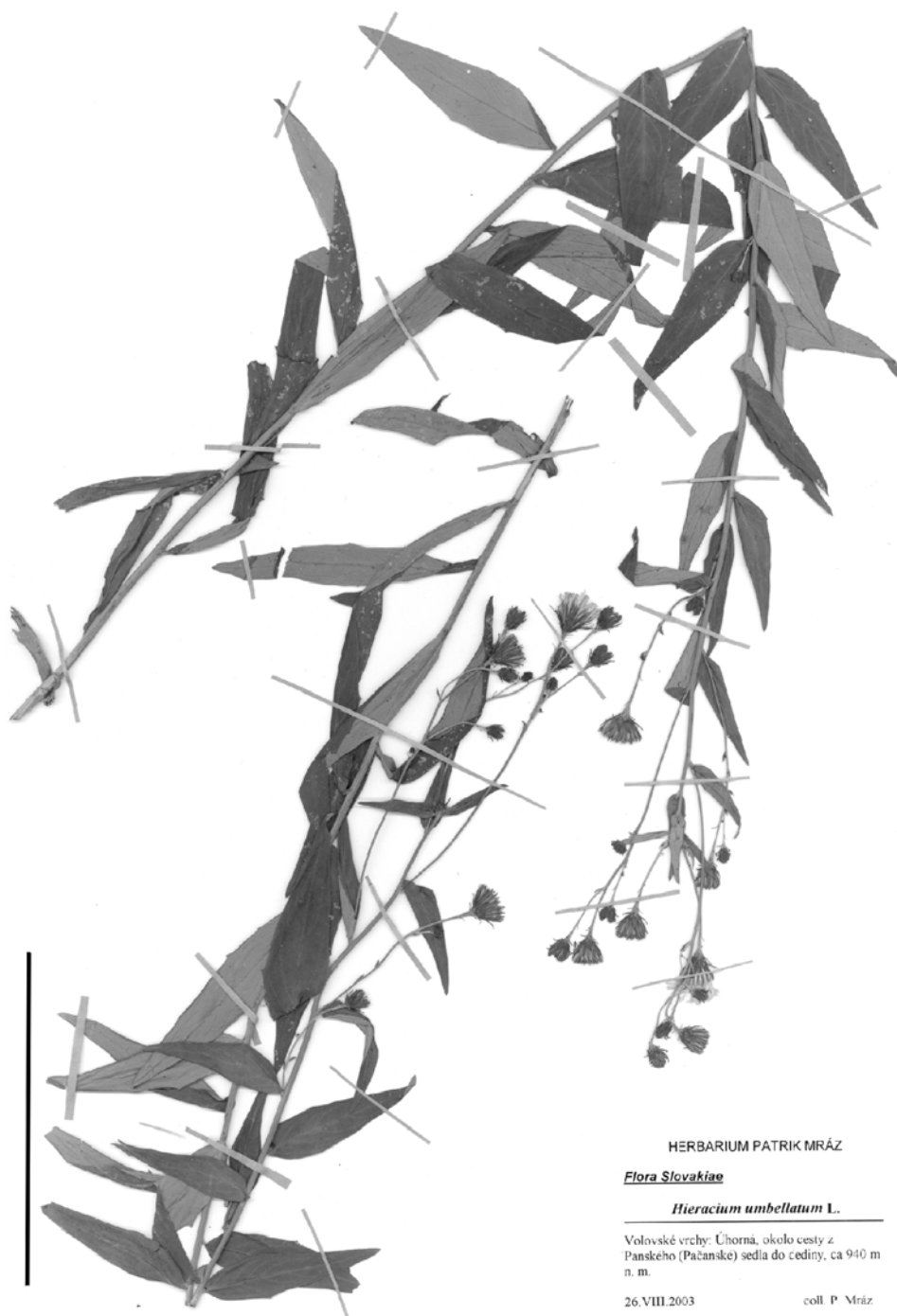
Fig. 5. – Habitus of parental taxon Hieracium umbellatum L. (morphotype of low altitude), scale bar = 10 cm.