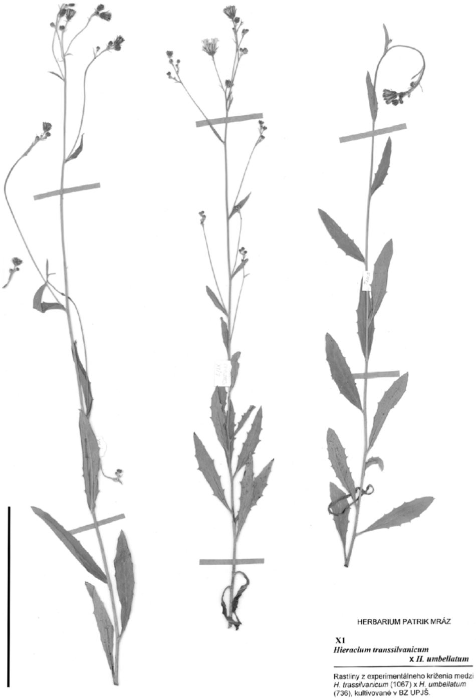
Fig. 6. – Hybrid progeny from cross no. X1: Hieracium transsilvanicum × H. umbellatum (morphotype of low altitude), scale bar = 10 cm.