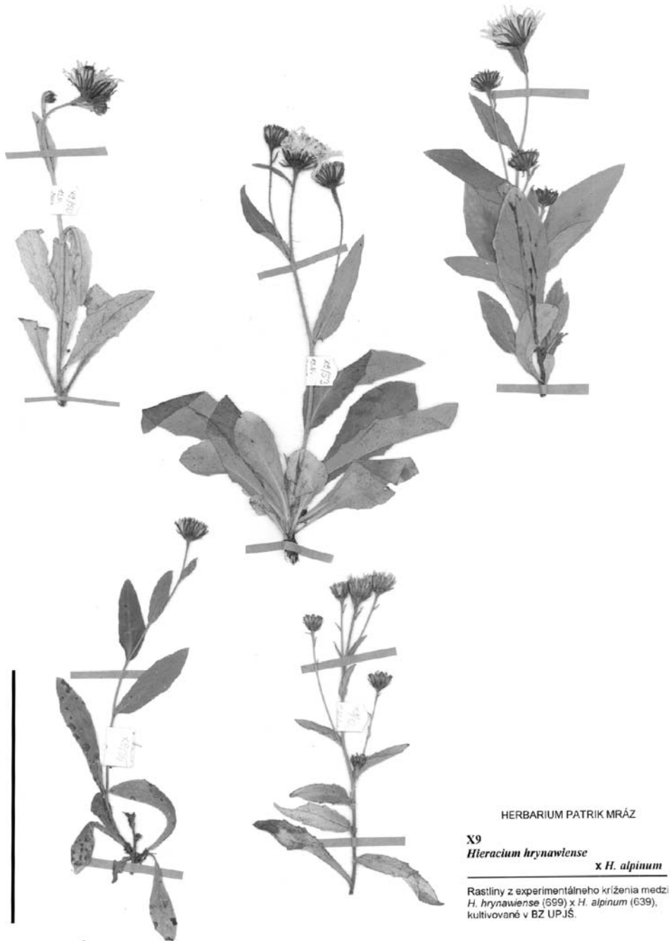
Fig. 8. – Hybrid progeny from cross no. X9: Hieracium umbellatum (high mountain morphotype) × H. alpinum , scale bar = 10 cm.