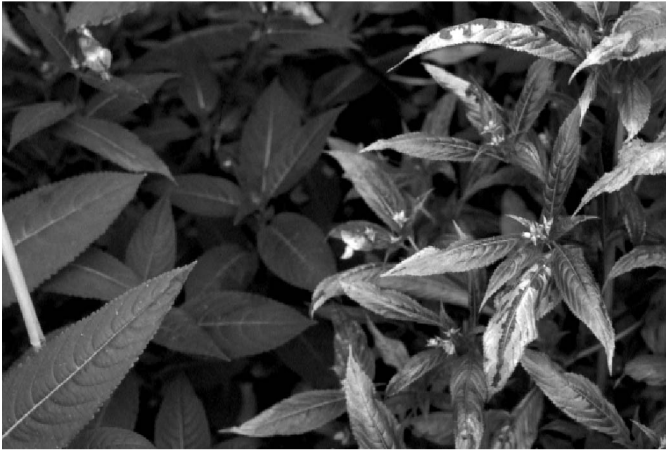
Fig. 1. – Flowering Impatiens glandulifera plants lacking (left) and showing symptoms of virus infection (right) in early August 2003.