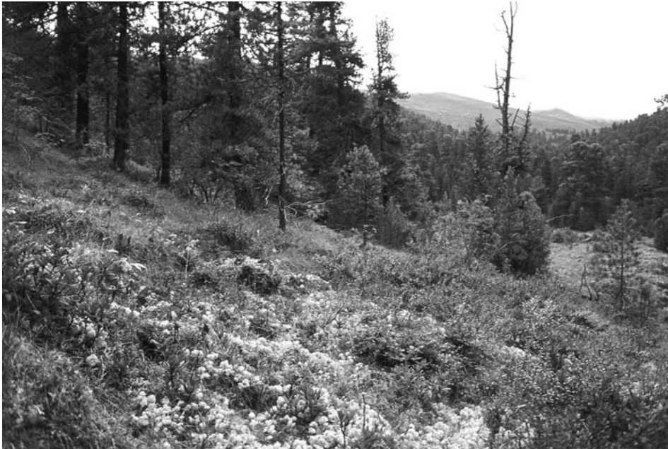
Fig. 4. – Montane taiga forest with Larix sibirica and Pinus sibirica and patches of dwarf shrubby vegetation with Betula nana (syn. B. rotundifolia ), Alnus viridis (syn. Duschekia fruticosa ), and Rhododendron dahuricum . Upper forest limit in Western Sayan Mts, 52°27'N, 91°49'E.

Important data relevant to the question of full-glacial forest refugia has come from the Pannonian Basin of Hungary and S Moravia. The vegetation situation from between 22 and 9 ka BP has been revealed by the pollen in a profile of sediments of the former Nagy-Mohos Lake (Magyari et al. 1999), which indicates the presence of Larix , Pinus , and Picea during the Last Glacial Maximum. Equally interesting is pollen from Late Glacial deposits in three Hungarian lakes, which indicate cold refugia for the same tree species and even some broad-leaved taxa (Willis et al. 2000). The pollen diagram from the Bulhary site in SE Moravia (Rybníčková & Rybníček 1991), dated to 25,675 \pm 2750 14C yr BP, indicates a coniferous forest containing Pinus sylvestris , P. cembra , Picea , Larix and Juniperus communis . In addition, sporadic pollen grains of temperate deciduous trees such as Ulmus , Corylus , Quercus , Tilia and Acer were also found. In the northern foothills of the Carpathians, several pollen profiles indicate presence of tree stands with Pinus cembra and Larix during warmer interstadial periods of the Weichselian Pleniglacial