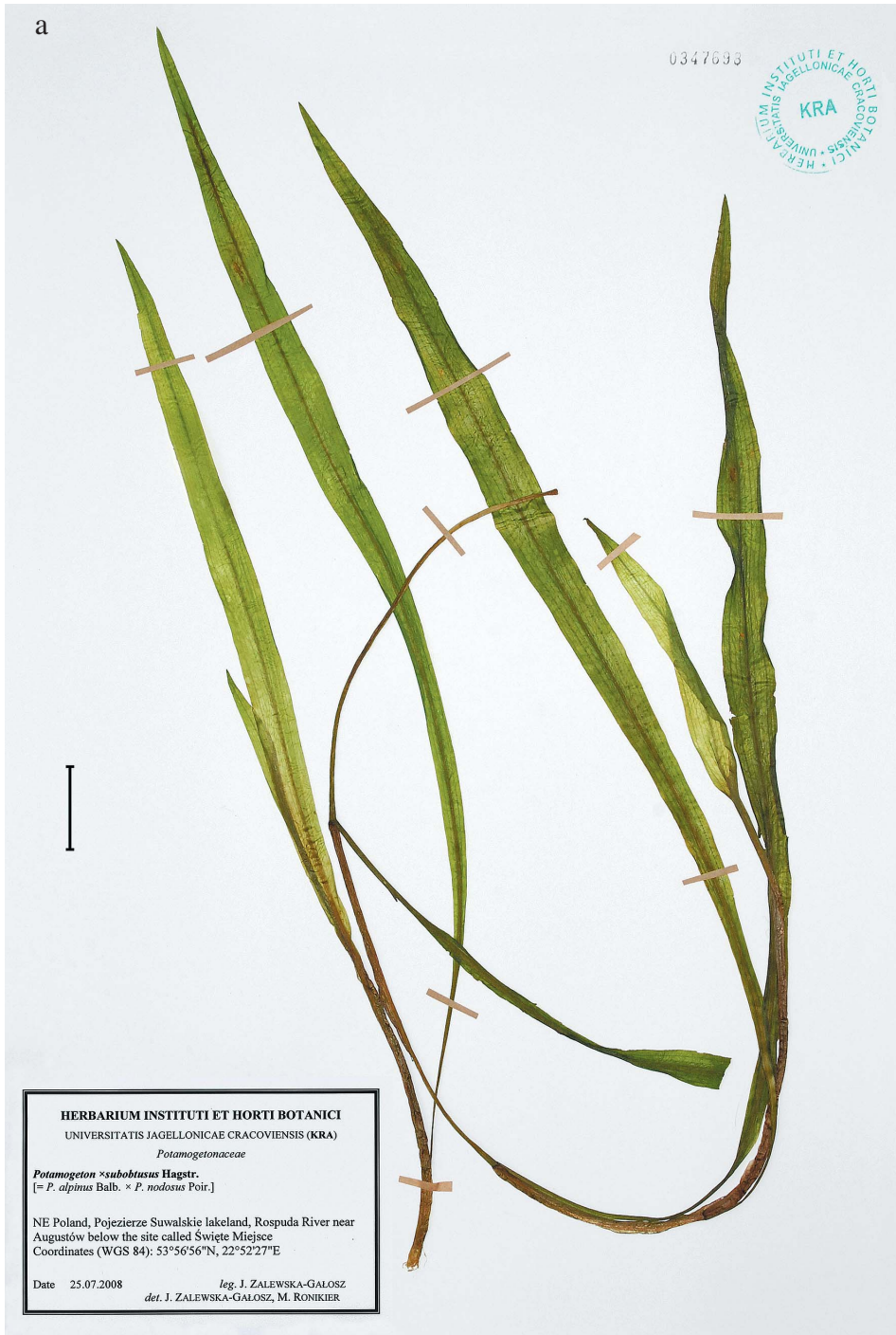
Fig. 1. – Potamogeton ×subobtusus from the river Rospuda, Poland; a – specimen with only submerged leaves, b – specimen with floating and submerged leaves; scale bar = 1 cm.