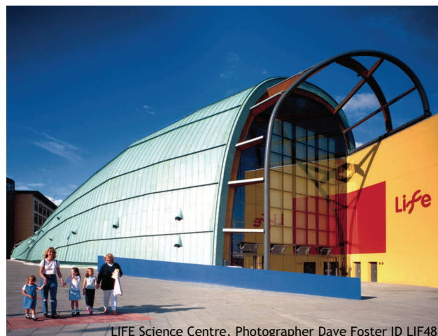
LIFE Science Centre