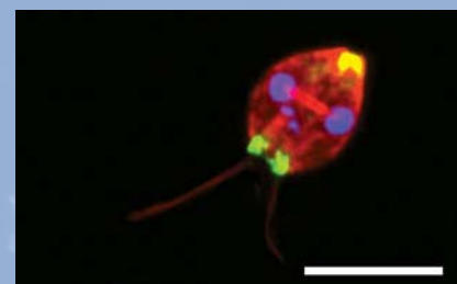
Mitotic Leishmania major , red - tubulin, green - vimentin