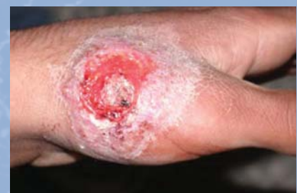
Cutaneous leishmaniasis