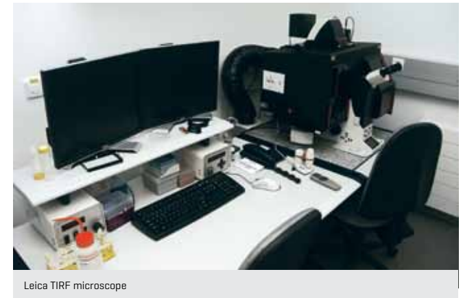
Leica TIRF microscope