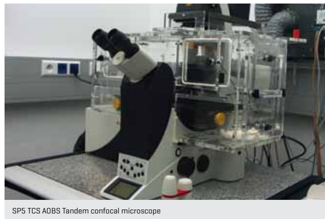
SP5 TCS AOBs Tandem confocal microscope