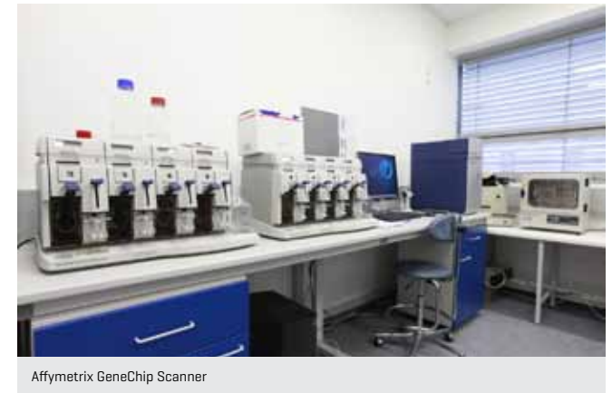
Affymetrix GeneChip Scanner