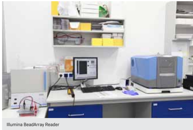
Illumina BeadArray Reader

The facility was established in late 2005 after the purchase of the Affymetrix GeneChip System and was initially operated by the staff from the Laboratory of Mouse Molecular Genetics. Since January 2007, it has become an independent unit which provides full chip microarray services, real-time quantitative PCR service and high-throughput methods using the robotic equipment. The services are provided not only to the research groups at the Institute of Molecular Genetics, but also to other academic institutions in the Czech Republic as well as abroad. The core facility is equipped with two microarray platforms: Affymetrix GeneChip System and Illumina BeadStation 500, real-time PCR cyclers Roche LC480, JANUS robots and EnVision Plate Reader from PerkinElmer, and also with instruments for assessment of quality and quantity of processed samples [spectrophotometer Nanodrop and capillary electrophoresis Agilent Bioanalyzer 2100]. The facility represents one of the European certified Affymetrix core labs.