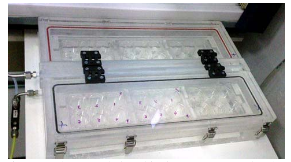
Figure 1. The upgraded Multiculture Exposure Chamber (MEC).

The objective of the present work was the further advancement of a Multiculture Exposure Chamber (MEC) (initially developed in Papaioannou et al , see also Asimakopoulou et al , 2011) into a dose-controlled system for efficient delivery of nanoparticles to cells (Figure 1). It was validated with various types of nanoparticles (Diesel engine soot aggregates, SiO<sub>2</sub> nanoparticles) and with state-of-the-art nanoparticle measurement instrumentation to assess the local deposition of nanoparticles on the cell cultures.