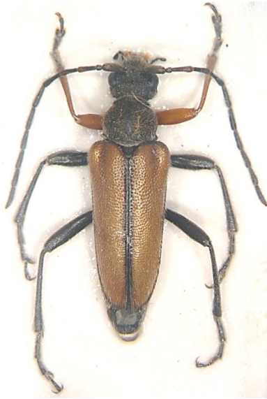
Figure 2. Cortodera flavimana flavimana from Çankırı prov.: Şabanözü, Orta road.