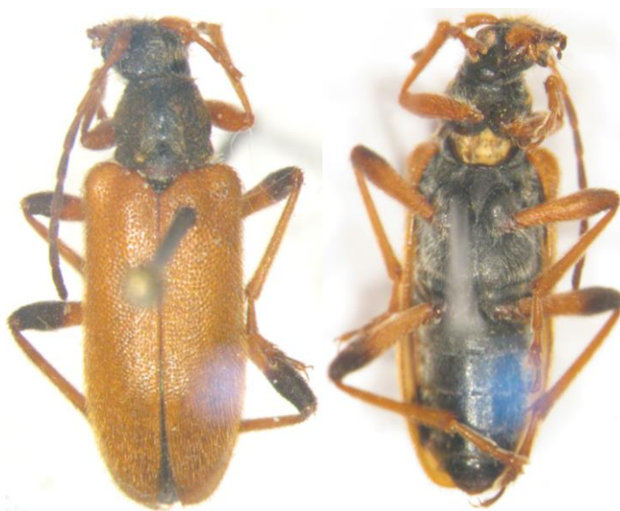
Figure 4. Cortodera orientalis didemae ssp. nov. (holotype ♂).