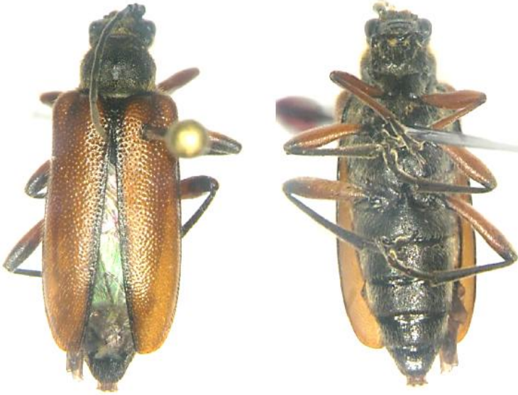
Figure 1. Cortodera neslihanæ sp. nov. (holotype ♀) from Çankırı prov.: Orta, Elden village.

Schaller, J. G. 1783. Neue Insekten beschrieben. Schriften der naturforschenden Gesellschaft zu Halle, 1: 217-328. Waltl, J. 1838. Beiträge zur Kenntniss der Coleopteren der Türken. Isis von Oken, Leipzig, 31: 449-472.