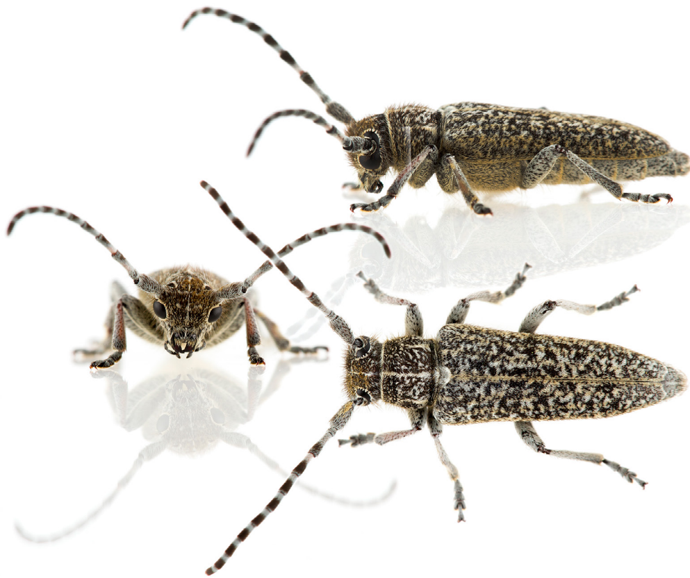
Fig. 2. Pilemia tigrina , details