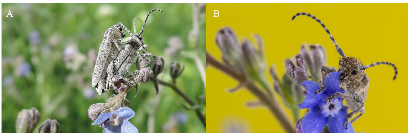
Fig. 3. Pilemia tigrina mating (A) and feeding (B)