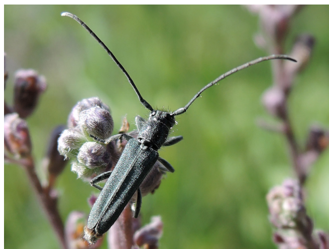
Fig. 5. Opsilia caerulea