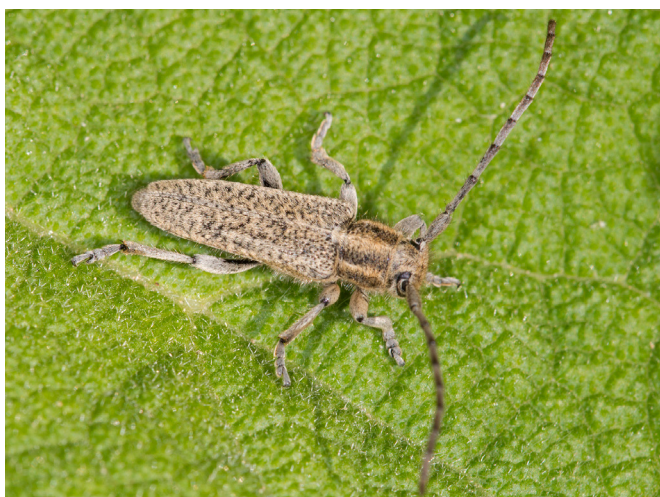
Fig. 4. Pilemia hirsutula