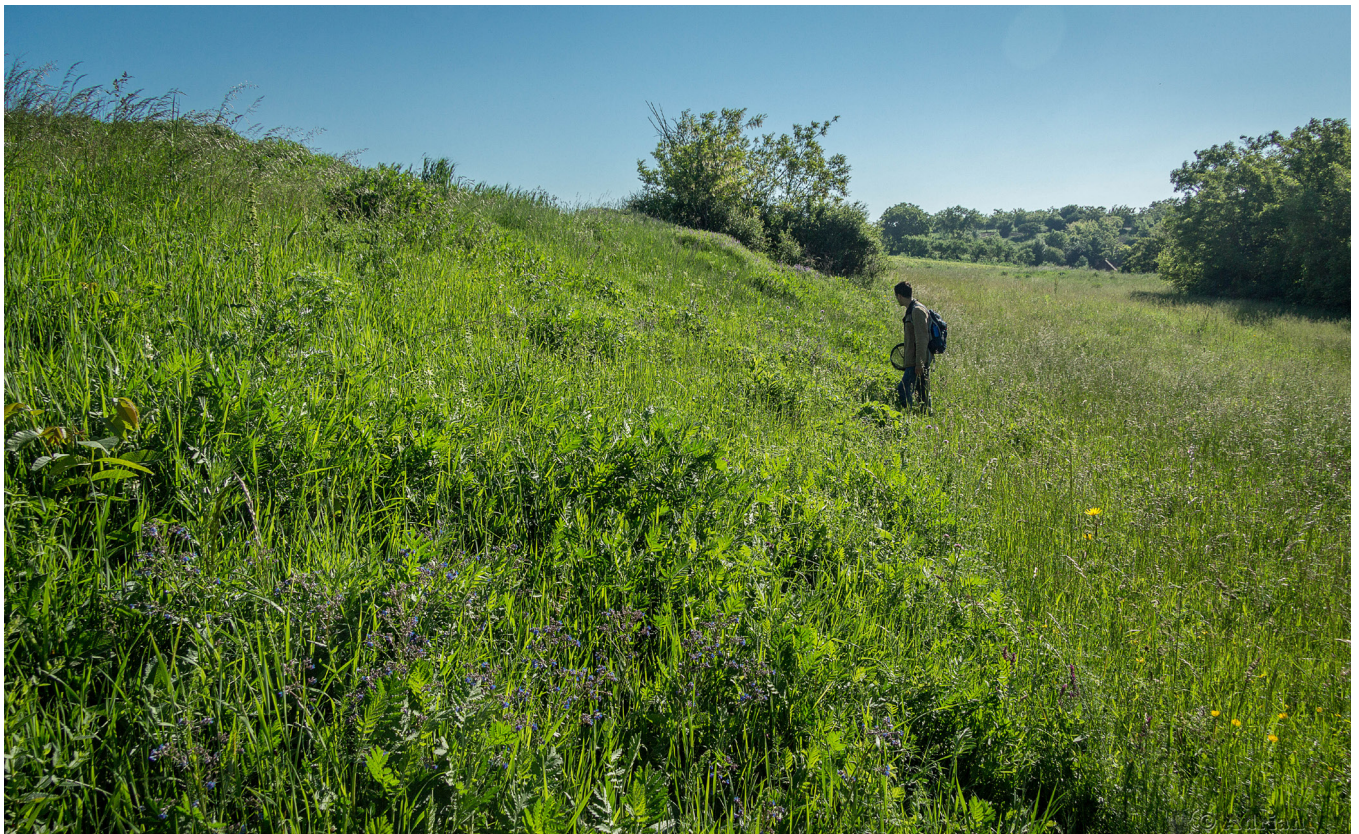
Fig. 6. Pilemia tigrina habitat, in Boju Cătun

Due to the fragmentation of habitats as a result of human activities over the past one hundred years (intensification of agriculture, infrastructure works, extension of human settlements), most of the populations of this species are virtually isolated from each other. Under these circumstances, even if it is more difficult to put it into practice, it would be important to make ecological corridors to connect