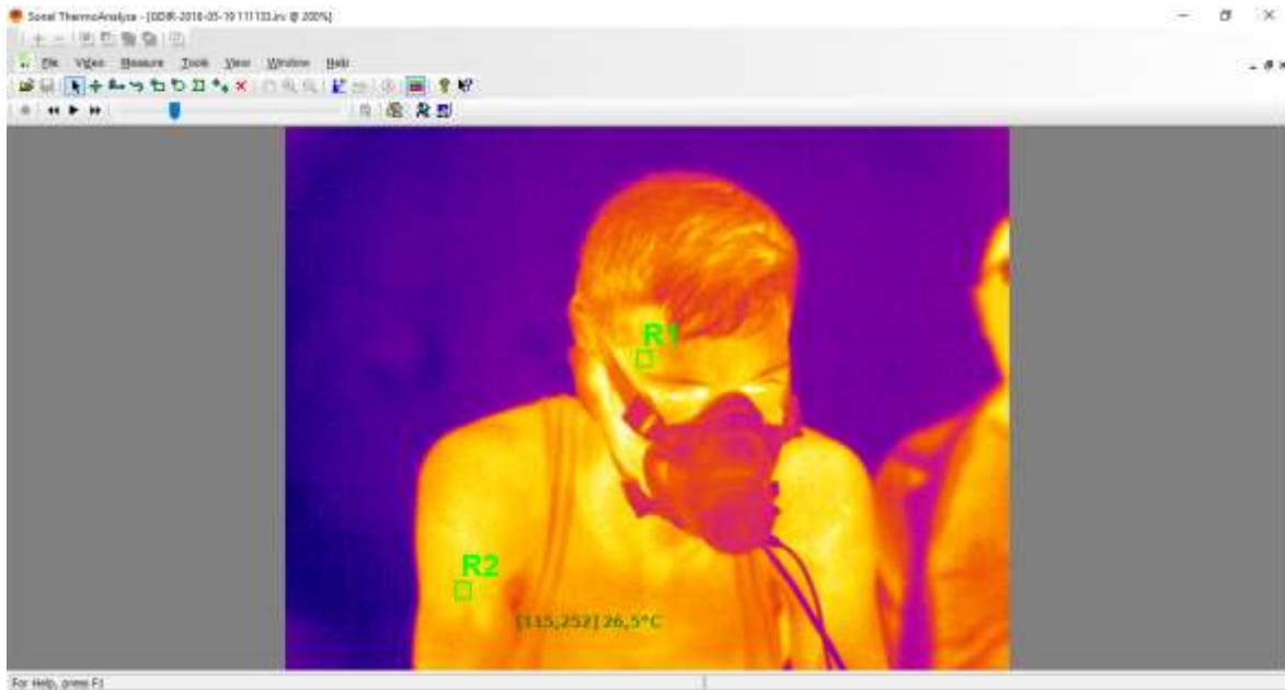
Figure 1. A single frame of a film recorded during SITP with marked fields for the temple surface temperature (R1) and arm surface temperature (R2) analysis.