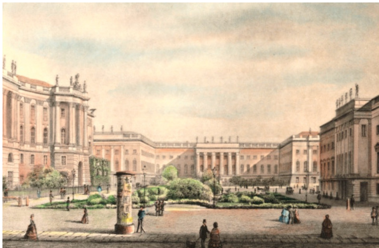
Figure : Opernplatz und Universität, Berlin 1860 (Borcher)