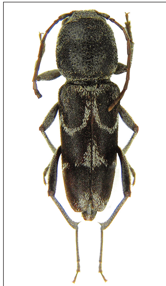
Figure 2. Pseudosphegesthes giglii n. sp., paratypus male, length 12.5 mm.

points on the whole surface. Two bands decorate the elytra: the basal band, in the first half, is arched towards the outer margin. This band starts just behind the scutellum and turns almost immediately to the outside. The second band is just behind the middle of the elytral length and is more or less transverse, enlarged close to the suture toward the apex and toward the base giving to this band a sort of "cross-shape". There are many ash gray recumbent short hairs on the shoulders, the lateral margins and the apical area. Apex obliquely truncate. Legs long with many very short, recumbent ash gray hairs, denser on the femora than on the tibiae. Tibiae with long, thin, light erect hairs, denser on the inner side, especially on the hind legs, sparser on the middle legs and quite absent on the forelegs. All