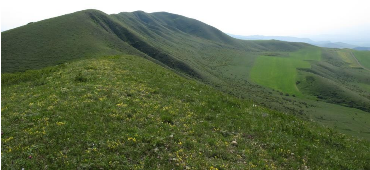
Figure 3. Type locality (the slopes 4 km NE of Gori).