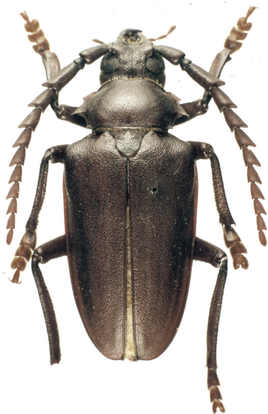
Figure 1b: Mesoprionus tangerianus .