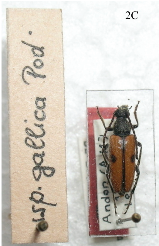
Figure 2°: 2A: Vadonia unipunctata gallica ♂, 2B: Vadonia unipunctata gallica ♀, 2C - ssp. gallica TYPUS.