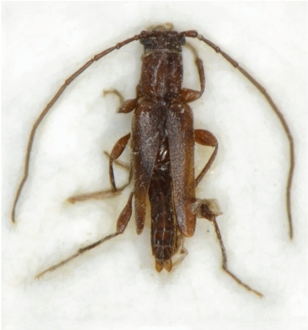
Figure 4: Nathrius berlandi