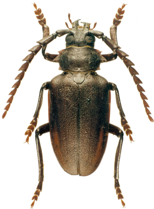
Figure 1a: Mesoprionus besicanus .

I described this species from Morocco as Prionus tangerianus Sláma, 1996. It is listed in CPC as a synonym of Mesoprionus besicanus , Fairmaire, 1855, however, the holotype is completely different from M. besicanus . Dissimilarities between tangerianus and besicanus listed in the original description, and the photographs below, clearly establish the validity of the species. I was very surprised with the arguments put forward to classifying this species as a synonym.