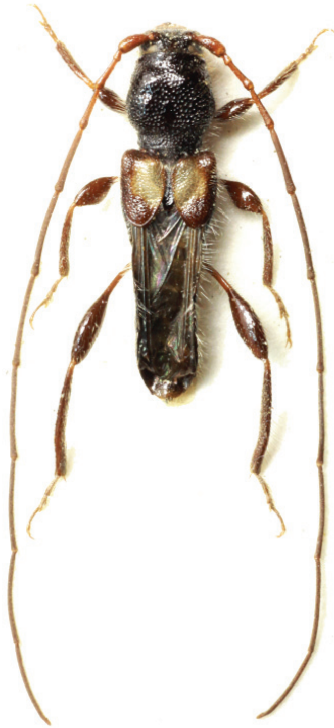
Figure 5: Glaphyra marmottani andalusica n. ssp.