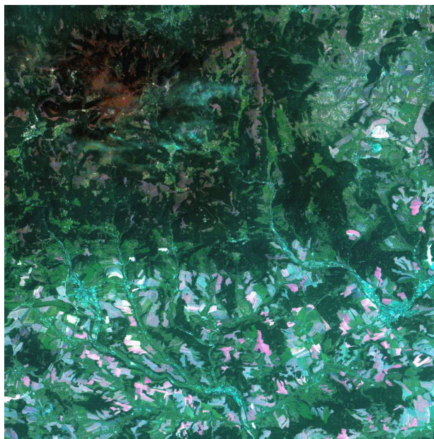
Fig. 2. The result