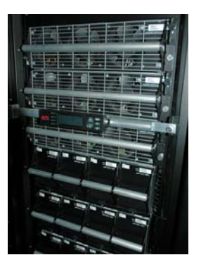
Data centre room