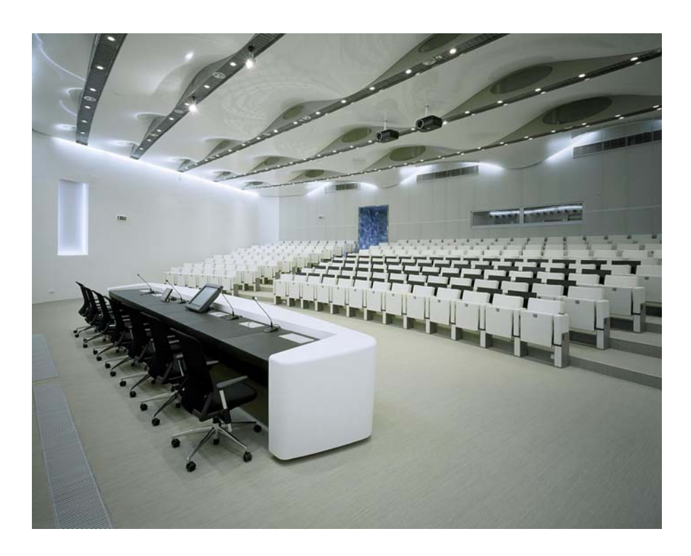
Milan Hašek Auditorium