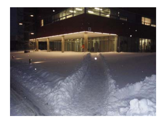
Entrance to the building –winter 2010