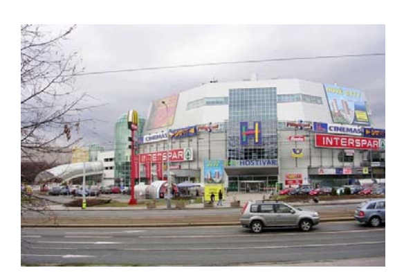
shopping centres in Prague are the same as everywhere