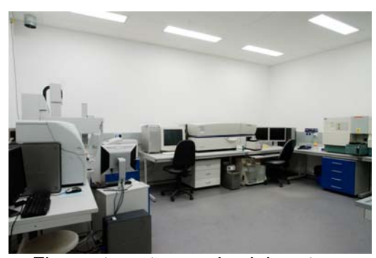
Flow cytometry service laboratory