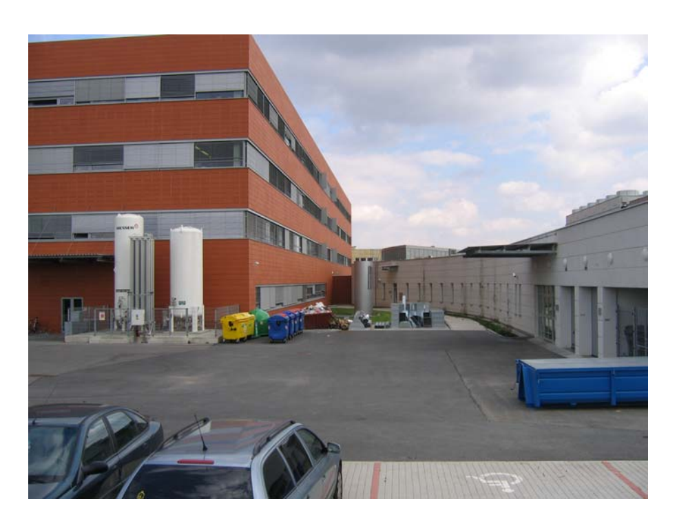
Animal facility on the right