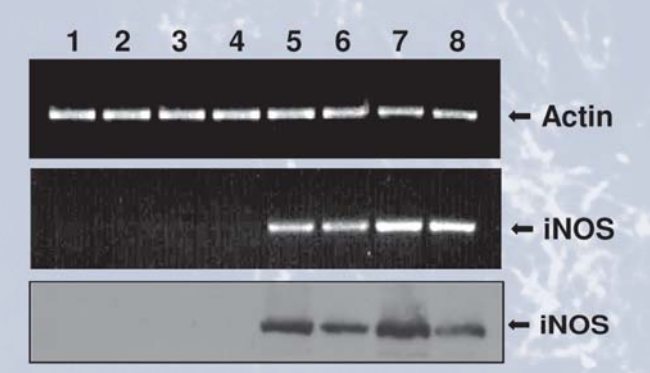
Expression of gene for iNOS and production of iNOS protein in normal mouse skin (1,2), syngeneic skin graft (3,4), rejected allograft (5,6) and rejected xenograft (7,8).