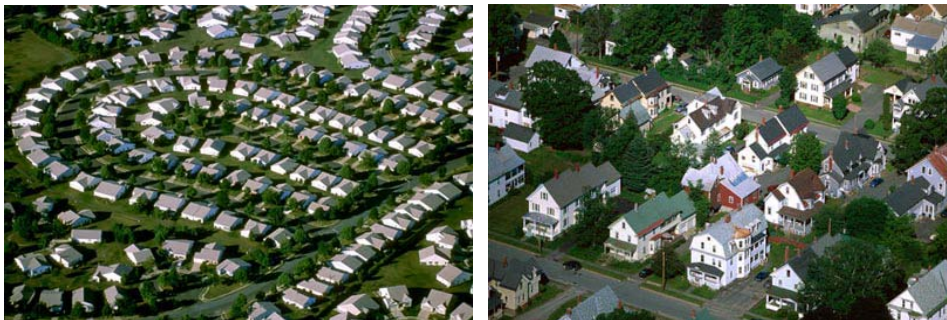
Figure 1. Impact of design on built environment

Quite often in residential area a block consisting of the single row of dwellings is provided. However, in low-income group housing doubly loaded blocks are also adopted. Relatively higher densities can be achieved with such blocks than blocks with single rows. Higher densities between 68% and 87% of net area densities are possible with doubly loaded blocks as compared to 52% to 78% obtained from single block. Relative increase in density varies between 13% and 57% (Sinha, 1982). However, in most cases about 20% to 25% more densities can be achieved with doubly loaded blocks. If higher floor area ratio is allowed doubly loaded blocks can result in higher densities. This section demonstrates that it is design rather than density that matters in creating better quality of built environments.