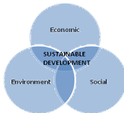
Figure 2: Sustainable Development

There are many definitions of sustainability. One definition widely used and accepted is by the World Commission for Environment and Planning (WCEP), which says cities are seen to be sustainable if they meet ‘the needs of the present without compromising with the ability of future generations to meet their own needs (World Commission for Environment and Planning, 1987). According to (Newman and Kenworthy, 1989) the concept of sustainability has emerged from a global political process that has tried to bring together, simultaneously, the most needs at present: (1) the need for economic development to overcome poverty; (2) the need for environment protection of air, soil, and biodiversity, upon which we all ultimately depend; and (3) the need for social justice and culture diversity to enable local communities to express their values in solving these issues. To achieve triple bottom line, concept design and density play very important role. Even though there are many definitions of sustainability it is generally agreed the economy, environment and social equity are three prime values of sustainability (Chan and Lee, 2009).