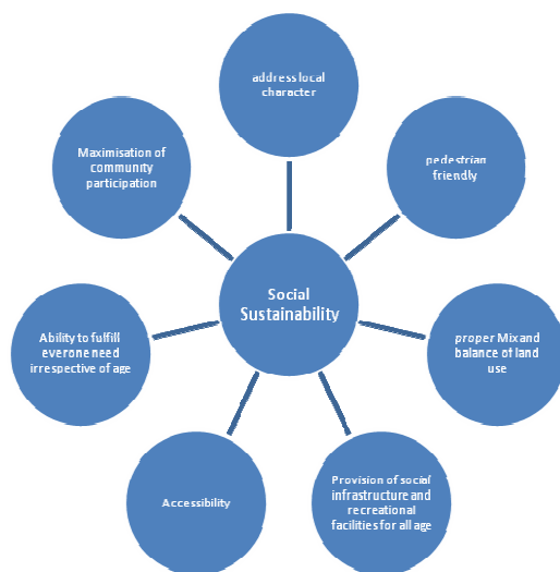
Figure 3: Design elements to make social sustainable neighbourhood

Social sustainability is improvement and maintenance of current and future well-being and it reduces social inequality and improves quality of life (Chan and Lee, 2007). Therefore, to achieve the quality of life, there is need for interaction within the community. Chan and Lee (2009) argue that form of development affect the micro climate of areas in terms of temperature, relative humidity, air quality, lighting level and ventilation flow, which affects human comfort. Intensity of interaction is very much related to design elements and layout pattern. For example, residential areas with the row house design and low density tend to reduce the interaction in society, whereas a dwelling unit in U-Shape and medium density increase the interaction. U shape layout increases the interaction because this provides a common entry point for everyone. Common area for passive and active recreation at residential level increases the interaction within the community. Pedestrian oriented neighbourhood provide opportunities for people to interact with society. Design is a key to create sustainable development by improving or enabling social equity, economic vitality and environmental responsibility (Chan and Lee, 2009). In order to ensure social sustainability could be achieved through design and density, number of design considerations has to be taken into account when preparing residential/urban development (refer figure 3).