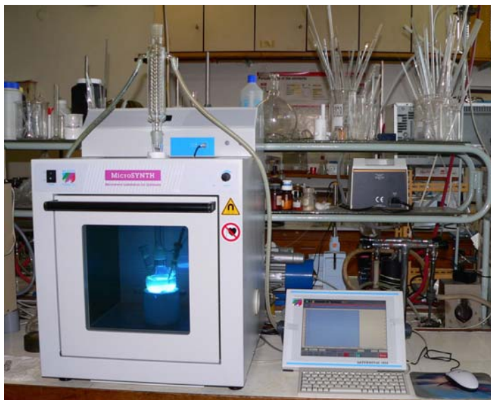
Fig. 2. Testing of the EDLs performance on Milestone's MicroSYNTH Labstation.

A typical experimental system for testing of the lamp performance consisted of a round-bottom flask (250 mL) containing n -heptane (bp 98 °C), equipped with a magnetic stirrer, a fiber-optic temperature probe with thermowell, Dimroth condenser, and placed to a MW oven (Fig. 2). Once the lamp is started (1000 W of MW output power), it produces except UV/VIS light also the heat, and therefore the n -heptane is warmed up. The EDL was conditioning for 10 min until no lamp blinking occurred.