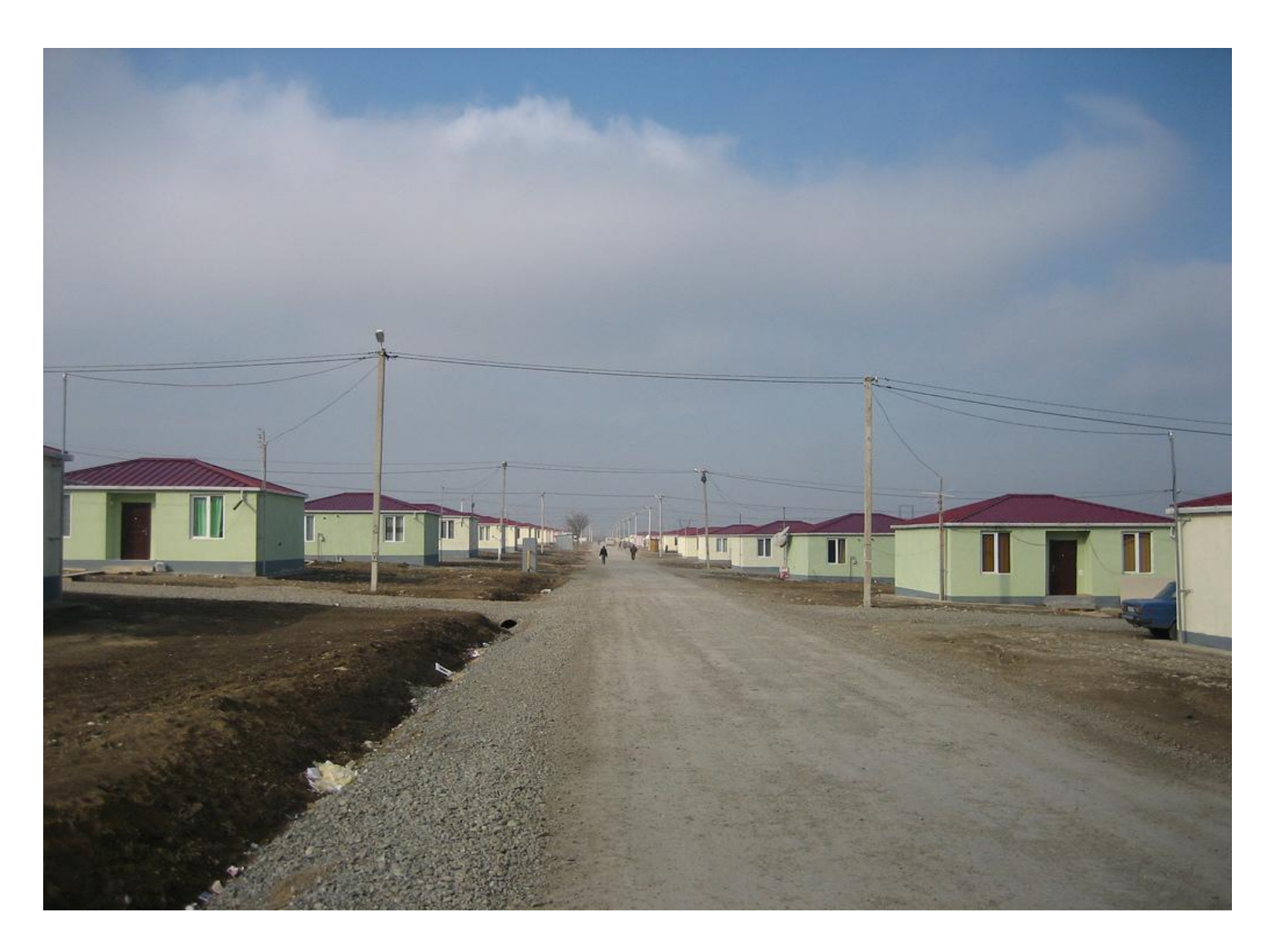
Housing for 'new' IDP's from South Ossetia.