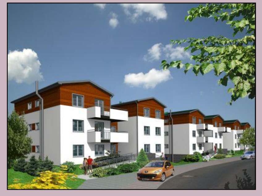
New suburban housing estate in Katowice