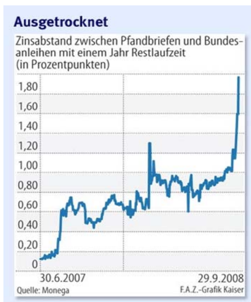
Fig. 4: Interest rate difference between Pfandbriefe and German federal bonds, source: Monega in F.A.Z.

According to statements from traders the secondary Pfandbrief market had dried out almost completely by the end of September 2009. Only private investors were able to sell or buy, but they had to accept very high margins between purchase and sale prices. Market participants