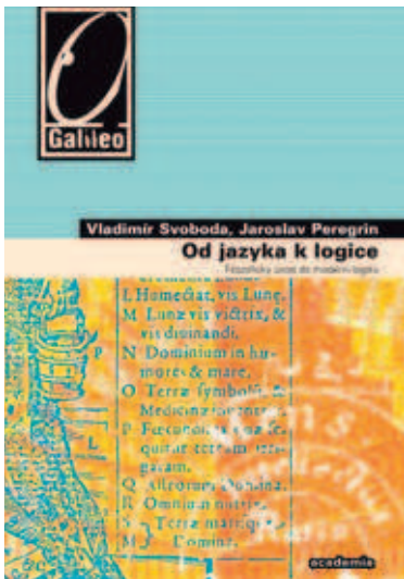
The cover of the book From Language to Logic

Svoboda, V. – Peregrin, J.: Od jazyka k logice. Filozofický úvod do moderní logiky. Academia, Praha 2009. 428 pp.