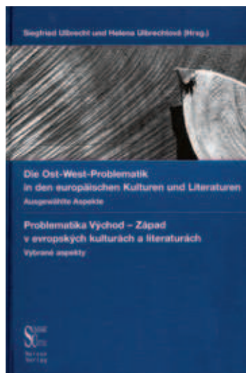
The cover of the book Die Ost-West-Problematik in den europäischen Kulturen und Literaturen [The 'East-West' Issues in European Cultures and Literatures]

Cooperating entities: Neisse Verlag Dresden, Detlef Krell Ulbrecht, S. – Ulbrechtová, H. (Hrsg.): Die Ost-West-Problematik in den europäischen Kulturen und Literaturen. Ausgewählte Aspekte. Problematika Východ – Západ v evropských kulturách a literaturách. Vybrané aspekty. Slavonic Institute of the ASCR / Neisse Verlag, Praha / Dresden 2009. 800 pp.