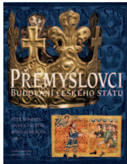
The cover of the book The Přemyslids: Building the Bohemian State