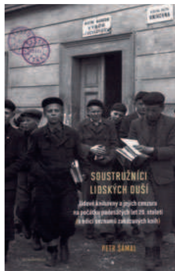
The cover of the book The Machinists of Human Souls. People's Libraries and their Censorship in the Early 1950s

Šámal, P.: Soustružníci lidských duší: Lidové knihovny a jejich cenzura na počátku padesátých let 20. století. Academia, Praha 2009. 613 pp.