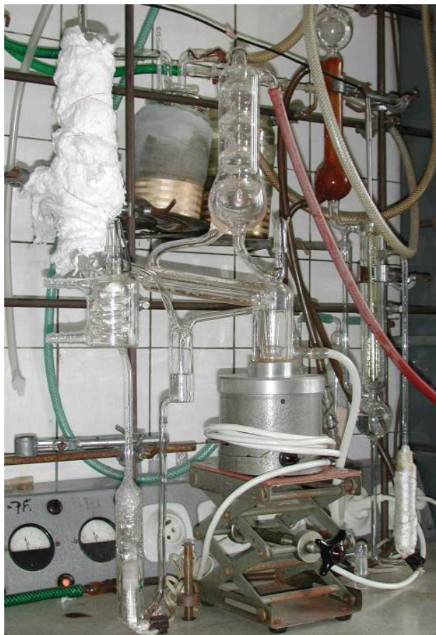
All glass recirculation still for VLE measurement