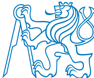
Faculty of Mechanical Engineering Czech Technical University in Prague