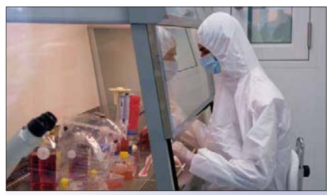
Work in the clean rooms.

Business Incubator (office area, GMP-certified clean rooms) for spin-off companies. The companies housed in the incubator benefit from shared consultation, patent, tax and other services and take advantage of opportunities to participate in applied research projects run in the IBC facility.