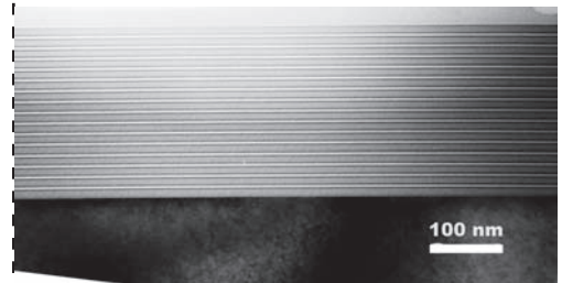
Cross section of the Si/C multilayer on silicon substrate