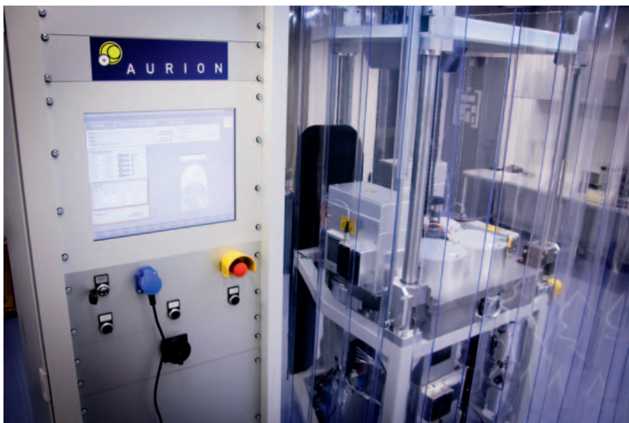
Computer controlled magnetron sputtering system Aurion

We look for cooperation with academic partners as well as companies in the fields of EUV and x-ray optics, photovoltaic solar cells, testing of thin films.