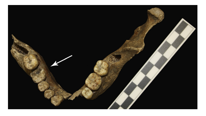
Fig. 8 – Mikulčice I—Grave Nr. 108. Caries in permanent lower first molar (arrow).

We used two characteristics to evaluate the caries prevalence—the caries frequency index (F-CE; C = caries, E = extraction) and the caries intensity index (I-CE; C = caries, E = extraction). Both indexes were introduced in the study by Stloukal and Vyhnanek.<sup>58</sup>