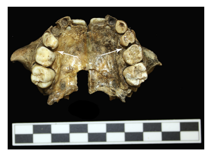
Fig. 7 – Mikulčice I—Grave Nr. 121. Caries in both deciduous upper first molars (arrows).