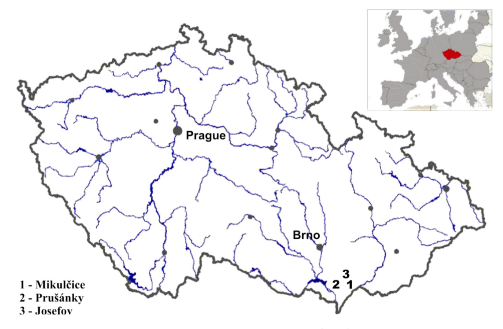
Fig. 1 – Early medieval Central European sites evaluated. (Edited by P. Stránská according to the images available under licence Creative Commons—Author: Petr Graclík and Wikimedia Commons—Author: David Liuzzo.)

When defining our aims, we drew from our previous study,<sup>4</sup> which compared the incidence of caries in the adult inhabitants of the Mikulčice centre and its hinterland. The results of that study indicated that socially differentiated