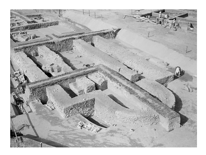
Fig. 3 – Mikulčice, third church on the hilltop settlement (acropolis). Finding of a three-naved basilica in 1957, long shot. The basilica was the biggest and probably also the most important church edifice in the Great Moravia area in the 9th century. In the burial site at the church, >550 graves have been examined.

groups did not demonstrate any differences in susceptibility to caries at a younger age; significant differences appeared only with increasing age. The population of higher socio-economic status from the Mikulčice castle showed a lower prevalence of caries compared to the rural population. Similarly, a lower