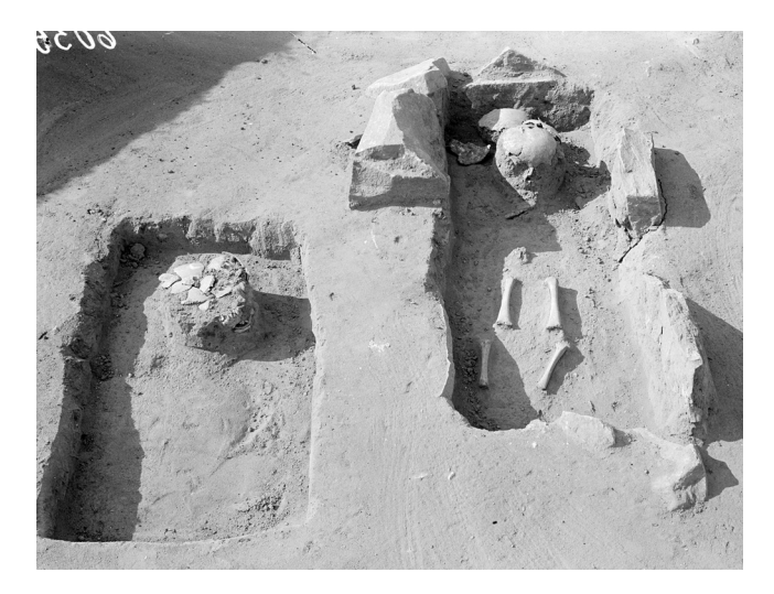
Fig. 6 – Mikulčice, burial site at the third church on the hilltop settlement (acropolis), graves Nr. 257 (right) and 258 (left). Both the children graves lacked any equipment.