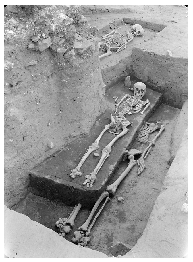
Fig. 4 – Mikulčice, burial site at the third church on the hilltop settlement (acropolis). The burial site at the church was extensively used for burials, as seen from up to three layers of graves.

prevalence of caries was found in individuals from 'rich' graves in all of the studied burial grounds.