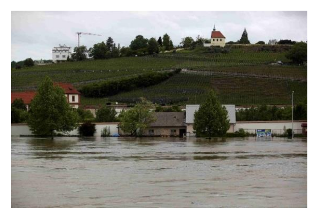
Floods in Troja District in 2002, on the front left early Baroque Chateau Troja

The main objective of the event is to present the latest developments in the Interreg Central Europe project ProteCHt2save to European and local authorities and stakeholders, with special accent on experiences in historic Prague, and to present a perspective and experiences from the point of view of management of cultural heritage protection in the changing environment.