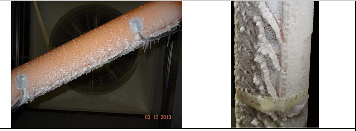
Test result of the ice accretion

wind tunnel investigations of Strouhal number of iced cable model of cable-supported bridges are presented. The methodology leading to the experimental icing of the inclined cable model in the climatic section of the laboratory was prepared. The Strouhal number was determined within the range of the Reynolds number between 28e3 and 122e3, based on the dominant vortex shedding frequency measured in the flow behind the model.