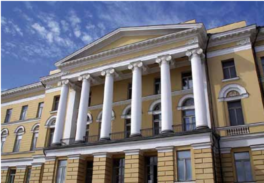
Front of the Main Building of the University, at Senate Square.. The building, designed by Carl Ludvig Engel in 1832, is the main venue of the conference.

trend, which affects even the countries without strong traditions of democracy and freedom of expression. But technological upgrades cannot help if society itself does not develop. Furthermore, the technologies can be used for the falsification of information in countries where journalists remain under pressure. The goal of this session is to give an overview of the situation with science journalism in former totalitarian countries: how it worked in the past and how it works today. We shall try to analyze how the totalitarian past continues to affect the current situation. The discussion will be especially important for the journalists from countries, which remain under a totalitarian system. We think it is also important to examine the situation in countries with strong traditions of democracy: even these countries had a period in which science journalism was under pressure. We believe that all presenters could critically reflect in their closing statements on the state of the art of science journalism across the continents. Western democracies are not always the best role models for the East and South. This is no excuse for past or present totalitarian countries; it is simply an invitation to recognise that we all still have a long way ahead of us and to shape up on the way (which will hopefully open up a lively discussion).