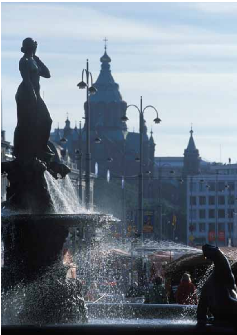
Havis Amanda statue, between the Market Place and the Esplanade Park, is a popular meeting place.