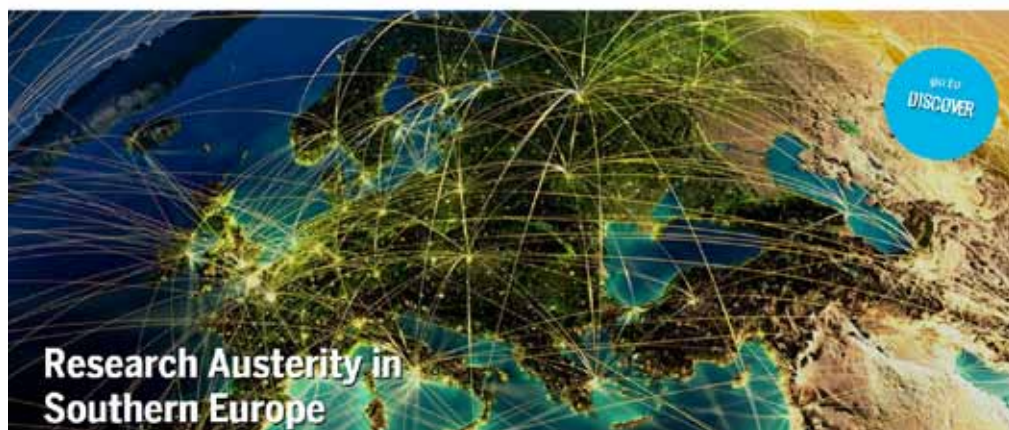
One of the most recent issues, devoted to research austerity in Southern Europe.

In Society 10 articles Policy 12 articles Innovation 11 articles Funding 7 articles Career & More & More 12 articles Look for more