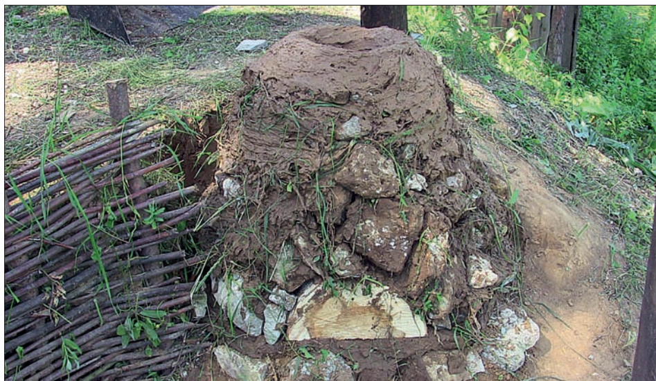
Fig. 2. The experimental model of the medieval Russian furnace. Obr. 2. Experimentální model ruské středověké pece.

The process started with 1 to 1.5 hour pre-heating of the furnace using dry pine firewood. The temperature on the throat of the shaft reached up to 550–600 °C. Afterwards, the furnace was charged up with charcoal and a powerful draft was provided.