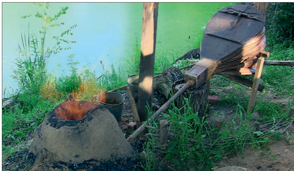
Fig. 3. The experimental furnace in operation. Obr. 3. Experimentální pec za provozu.

of reduced iron. During the experiment 7 kg of the conglomerate was used and three pieces of bloomery iron weighing 1 kg (altogether) were made. Metallographic examination of one of these pieces revealed a structure of ferrite with disproportionate grain size (2–5 GOST 3 ) and with a number of large slag inclusions. Microhardness of the ferrite is 170–181 HV0.1.