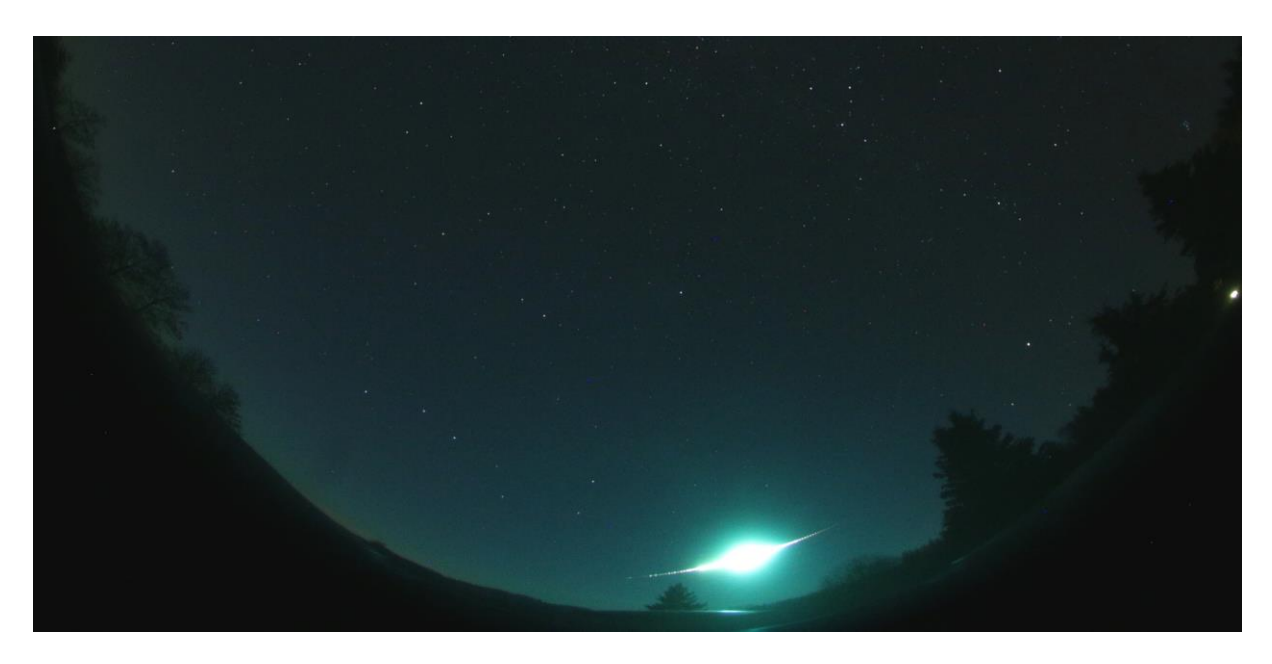
Figure 3. Part of the all-sky image containing the brightest Taurid bolide taken by the digital autonomous camera at station Polom on October 31, 2015 at 18:05:20 UT (exposure 35s)

Figure 2. Detailed view of the two brightest Taurids over Poland recorded by the analog autonomous camera at station Polom during the night from October 31 to November 1, 2015 (all night exposure)