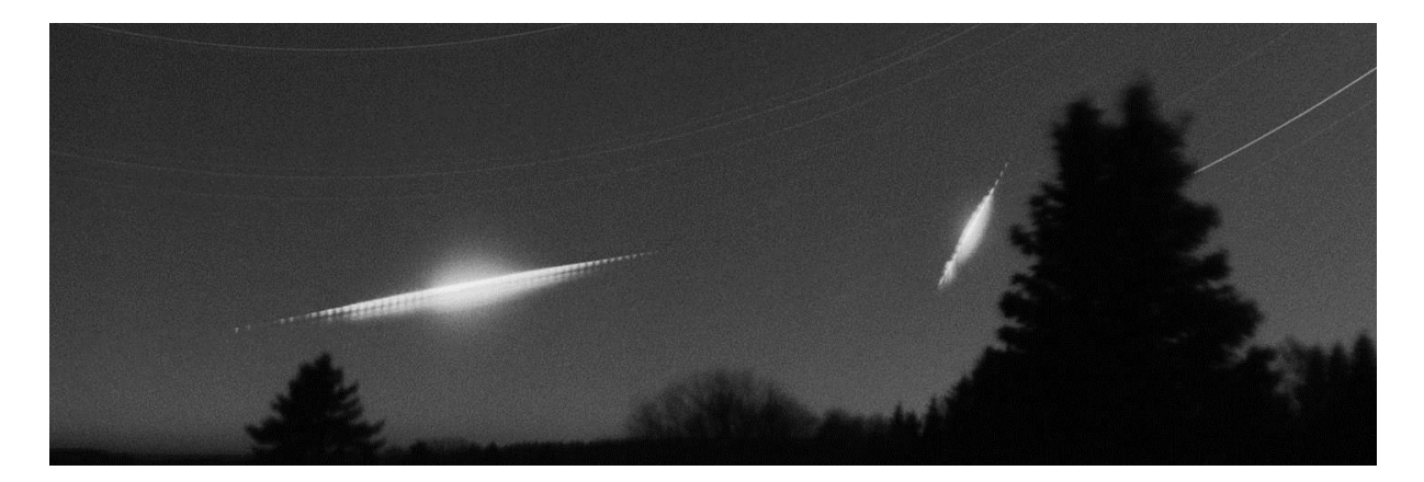
Figure 2. Detailed view of the two brightest Taurids over Poland recorded by the analog autonomous camera at station Polom during the night from October 31 to November 1, 2015 (all night exposure)