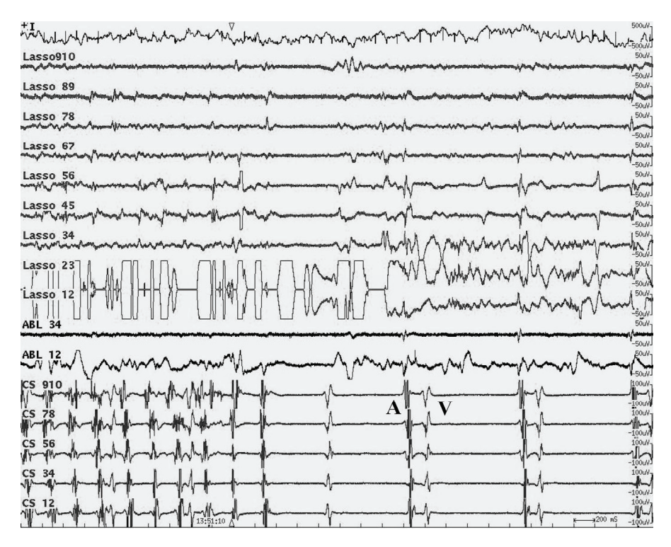
Fig. 2. Intracardiac ECG record. CS – left atrial activity recorded from coronary sinus by exploratory catheter: initial paroxysmal fibrillation followed by sinus rhythm due to radiofrequency energy application (arrow). LASSO catheter scans fast irregular atrial activity in pulmonary vein throughout. A – left atrium, V – left ventricle, ABL – records from ablation catheter.

temperatures below 43 °C. The power used ranges between 15-30 W.