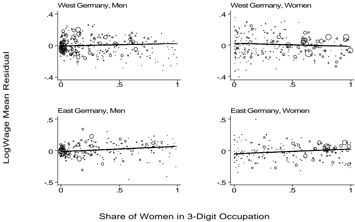
Figure 4.2: Occupation-Level Relationship between Wage Residuals and ‘Femaleness’ in 1995

occupation’s size is important; giving each occupation equal weight would result in a negative effect for West German men.