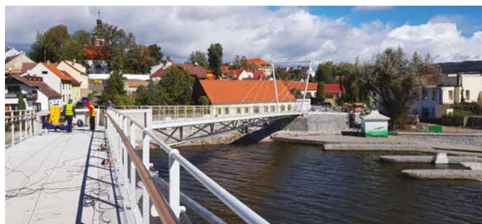
Footbridges in Písek during the dynamic loading test

At the end of September, a team from the Department for Dynamics and Stochastic Mechanics performed a dynamic loading test of two successive footbridges in Písek. The author of both of them – a cable-stayed one leading from the left bank of Otava river and a suspension one leading from the right bank – is architect Josef Pleskot. The aim of the test was to determine modal characteristics of the bridges and to compare them to a theoretical calculation done by a longstanding industrial partner of ITAM, EXCON company. A part of the test comprised a crossing of both bridge decks by several formations of pedestrians walking with various gait frequencies, which aimed to simulate norm-prescribed loading conditions and expected traffic. The comfort of pedestrians was then evaluated based on the detected bridge deck acceleration.