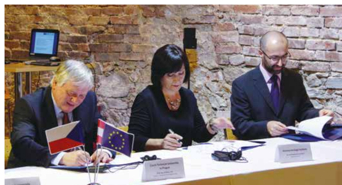
Signing of the memorandum

The aim of the SCOLA TELCZ activity, is not only the strengthening of relationships between the institutions and the participants, but also an opinion exchange forum on different approaches and solutions to specific problems of cultural heritage preservation and conservation from the point of view of different scientific disciplines. More information: www.scola-telcz.net