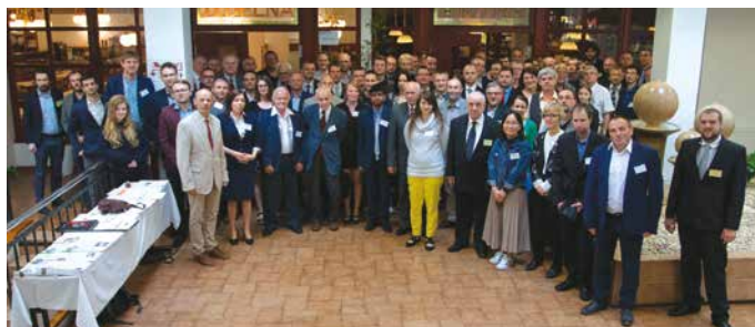
Participants of the EM2018 Conference

The 24th annual international conference Engineering Mechanics 2018 took place from 14th to 17th of May, 2018 in Svratka. Organised by ITAM CAS, it is the main event of its kind in Czechia. More than 250 experts were present, both from the academic sphere and professionals. Participants from several European countries arrived to exchange their experience and knowledge regarding development of mechanics of solid and deformable objects, fluid mechanics and thermodynamics, especially in relation to projects investigated in Czechia and at cooperating universities around the world. The output is a printed open access book of conference proceedings with 242 contributions available at: www.engmech.cz/im/proceedings/ .