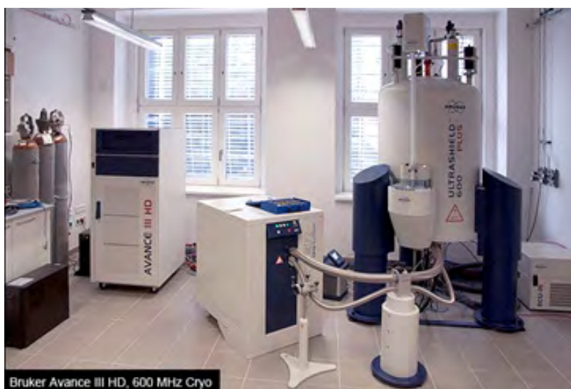
Bruker Avance III HD, 600 MHz Cryo