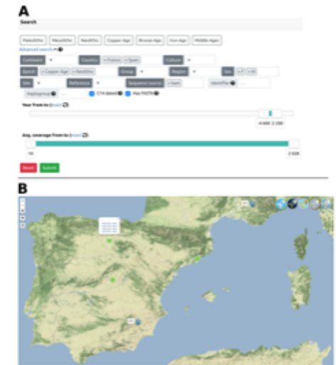
Figure 2. Example output from the AmtDB search engine (A) and visualization of the results on a map (B).