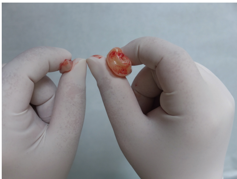
Fig. 2. Differences in the size and diameter of the umbilical cord at 23+5 weeks (left) and at 40+2 weeks of pregnancy (right), again demonstrating the difficulty of separate arterial and venous sampling in premature births.

The investigation of steroids in mixed umbilical blood (UM) involves composite information as concerns the functioning of the fetoplacental unit, but additional knowledge of steroid arteriovenous differences (AVD) in umbilical blood may bring more precise insight into the functioning of the individual compartments. However, the selective aspiration of umbilical arterial (UA) and