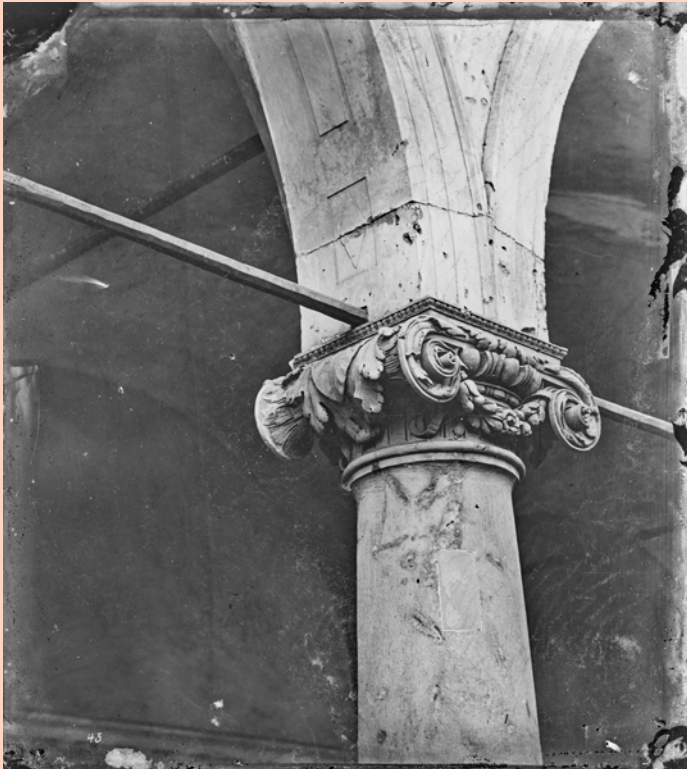
Josef Schulz, Column capital, the Belvedere in the Royal Garden of Prague Castle, 1865 collodion negative, digitally inverted, verso, 160 × 145 mm, IAH CAS